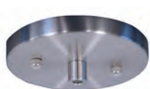
MonoPoint Included with pendant. Shown in Brushed Nickel.