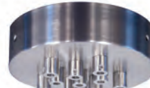
RLM80C11-NK Eleven (11) Port Round Canopy. Shown in Brushed Nickel.