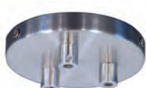
RLM80C3-NK Three (3) Port Round Canopy. Shown in Brushed Nickel.