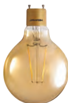
MLG322 3W LED G25 Filament Lamp GU24 Base (LG6803DGD-GU24)