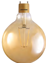
MLG222 3W LED G40 Filament Lamp GU24 Base (LG6903DGD-GU24)