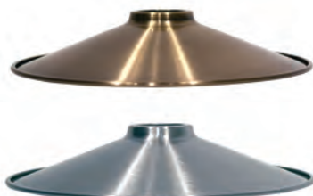
CTMC200-(NK, ABR) Cone Shade, Small (7-7/8" Dia.)