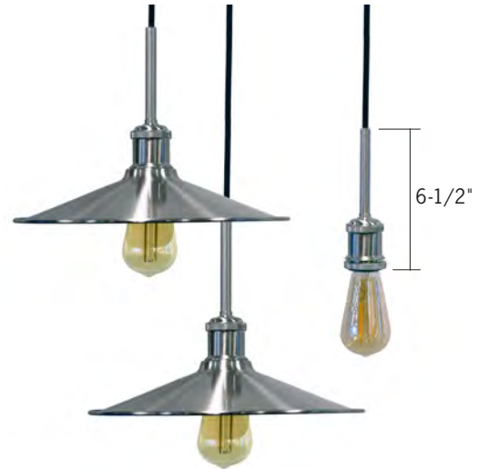
Shown with optional CTMC260-NK shade

cCSAus listed to UL Standards. Canopy mount suitable for dry or damp location. Track adapter mount suitable for dry location.