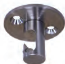
RLM80SH-NK Swag Hook. Includes two drywall anchors and mounting screws. Shown in Brushed Nickel.