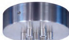
RLM80C7-NK Seven (7) Port Round Canopy. Shown in Brushed Nickel.