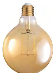
MLE222 3W LED G40 Filament Lamp E26 Base (LG6903DGD-E26)