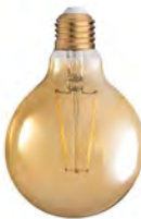
MLE322 3W LED G25 Filament Lamp E26 Base (LG6803DGD-E26)